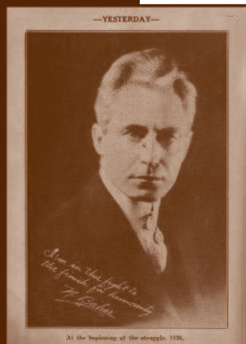
At the beginning of the struggle, 1930.