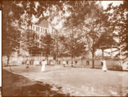
R HOSPITAL, EUREKA SPRS, ARK